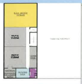
Lower Level Shared Storage