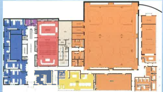
Community Center/Administrative Center/NCTV